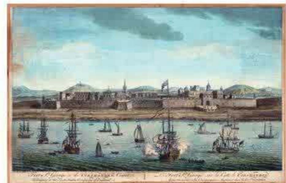
A painting of trading ships

Right from the ancient times, India has traded with China, West Asia and Europe. Indians sold cotton, gold and spices to these countries. The oldest port is said to be near Ahmedabad in Gujarat. It was used around 4500 years ago. Calicut, Kolkata, Mumbai, Chennai, Goa and Tuticorin are supposed to be the oldest ports in India that are still active.